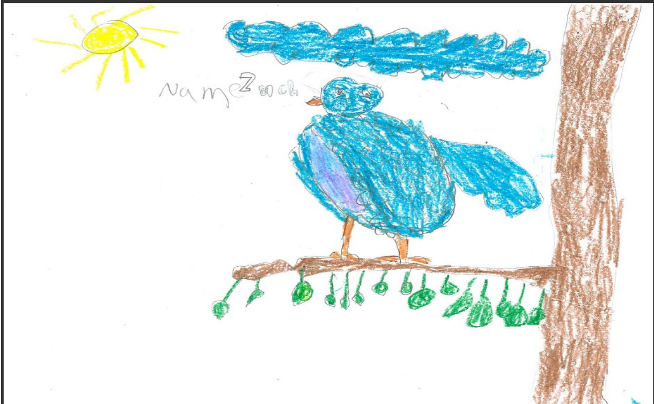
By Zach Schubert

This month in PE students in grades 3-8 have been playing Volleyball! The students have shown excellent form in their bumping and serving. Great job 6th grade for giving this unit 100% of your effort! It really shows!!! Underhand serving has proven hard for some but remember to concentrate and that ball will go flying!!! To finish the unit students are going to learn to set and spike in the upper grades. The lower grades have been practicing balancing. They have balanced their bodies on different levels (low and high) and in different movement patterns (straight and zig-zag). They have even balanced tennis rackets on their heads!!!! Great job students!!!